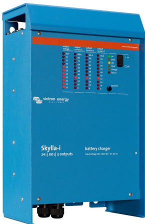
Skylla-i 24/100 (3)